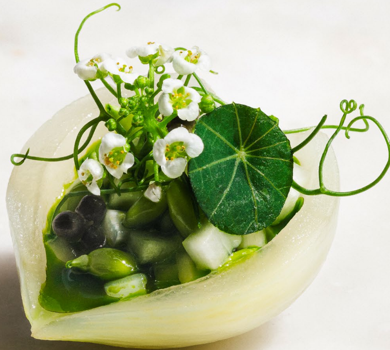
Pickled white asparagus, alliums and sweet peas